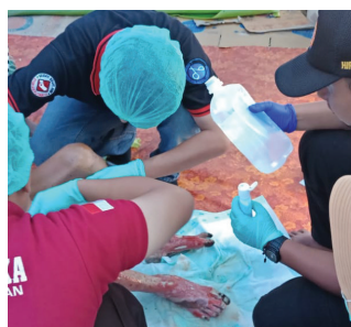
Figure 4. Applying code C. Using normal saline and a gentle antiseptic to clean the wound