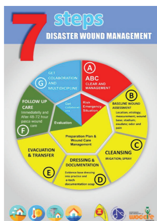
Figure 2. Seven Steps Disaster wound management poster