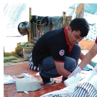
Figure 5. Applying Code D. Dressing the patient's wounds