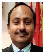
Author: Harikrishna KR Nair

Oxygen has long been acknowledged as playing a significant role in wound healing (Gordillo and Sen, 2003). This article looks at the impact of increased oxygenation on wound healing through a case series of eight patients commenced on NATROX® therapy after presenting with a non-healing diabetic foot ulcer (DFU) despite receiving a good standard of care – regular debridement, off-loading and regular dressing. The device, which is lightweight and discreet, helped to promote patient concordance and proved to be an effective therapy option, resulting in extremely positive patient outcomes.