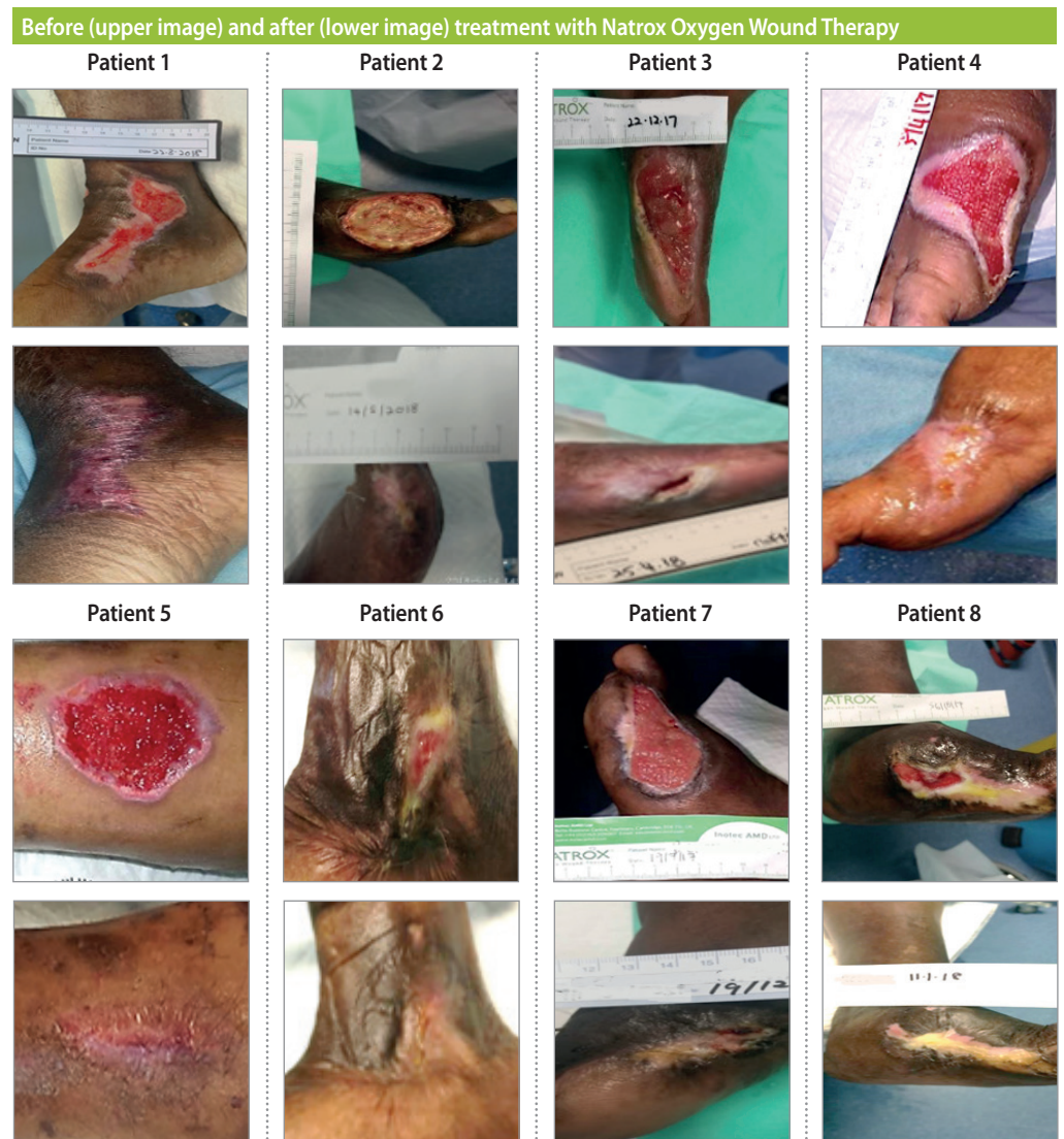
Figure 2. Clinical photographs taken before and after NATROX Oxygen Wound Therapy