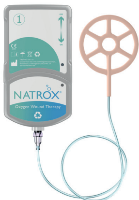
Figure 1. The Natrox® device

al, 1967). Chronic wounds have an oxygen level of 5–20 mmHg, which can go down to 0–5mmHg in devascularized regions (Howard et al, 2013). Wound cells convert to anaerobic at oxygen levels below 20 mmHg slowing the wound healing process (Howard et al, 2013). The concept of increasing the oxygen concentration in healing wounds developed originally with hyperbaric oxygen therapy (HBOT), and from the fact that oxygen is one of the most essential elements used during cellular metabolism. Poor tissue oxygenation, as is often seen in diabetic foot ulcers (DFU), is a significant impediment to cellular activity and is, therefore, very likely to impair wound healing. HBOT has shown only limited success because it is only possible to use it for very short periods of the week, limiting its efficacy in raising oxygen levels in wounds for a prolonged period (Margolis et al, 2013). For DFUs, 20–40 sessions of HBOT are required to show any significant change. In addition, access is difficult in many areas; it is also expensive and requires a considerable time commitment from the patient (Johnston et al, 2013). Therefore, an alternative technological solution to increasing oxygen levels is an exciting development for this expanding market.