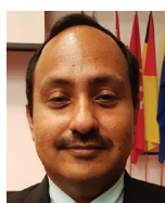
Authors: Tjun Y Tang, Tze T Chong, John CC Wang, Edward C Choke, Harikrishna KR Nair

Oxygen has a critical role in wound healing including the production of energy to fuel cell metabolism, angiogenesis, fight infection, collagen synthesis and re-epithelization. Natrox® represents a new development in topical oxygen therapy, as it provides a more practical and patient-friendly mode of delivery for oxygen therapy. It is lightweight, the size of a mobile phone and portable, and can provide continuous oxygen therapy to a wound. It is suitable for wearing under clothes during the day and can be positioned to be used comfortably at night, facilitating continuous use in a way that suits a patient's everyday lifestyle. The clinical evidence thus far suggests it can help heal chronic wounds such as diabetic foot and venous ulcers with high patient satisfaction. However, more research is required to help position this device in the wound healing arena and identify when it is indicated.