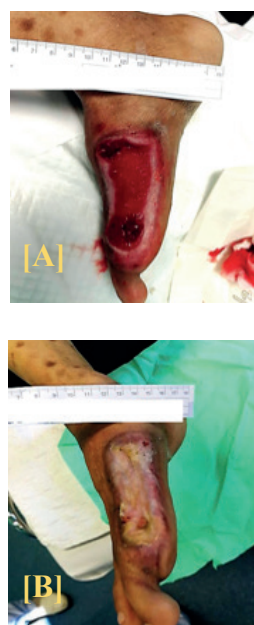
Figure 4. Case Study 2

A 45-year old Malay gentleman with type 2 diabetes mellitus with oral hypoglycaemic agents failure and on insulin therapy, presented with a right gangrenous hallux. The glycaemic control was poor and he was put on a basal bolus regime and intravenous antibiotics to combat infections were started. Once his diabetic state was stabilised, an extended Ray amputation was performed, which resulted in an open wound. Gold standard of care was maintained for the next 4 weeks, however, during this time the wound failed to progress. At this time, the wound was deemed non-healing. Due to the high risks of further amputations associated with diabetic foot wounds, the clinic practices a very proactive approach to wound healing. Hence, following sharp debridement, continuous topical oxygen therapy (Natrox®) was commenced [A] with the goal to stimulate wound healing and achieve full wound closure quickly. Natrox® oxygen therapy was maintained for the next 31 days with significant improved noted [B] to the wound. On review, the wound had achieved over a 95% wound re-epithelialisation. Natrox® was discontinued at this time and the patient was returned to "normal" advanced wound dressings till complete wound closure was achieved. Initiating such a proactive approach to diabetic foot management achieved both clinical and economic benefits.