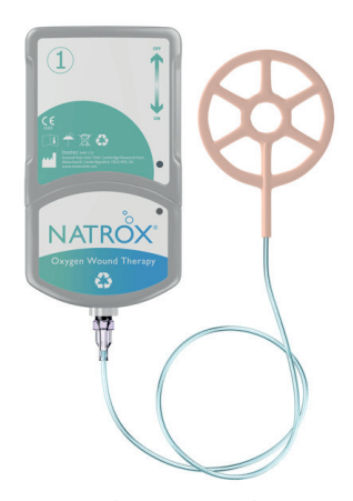
Figure 1. The Natrox® device

al, 1967). Chronic wounds have an oxygen level of 5–20 mmHg, which can go down to 0-5mmHg in devascularized regions (Howard et al, 2013). Wound cells convert to anaerobic at oxygen levels below 20 mmHg slowing the wound healing process (Howard et al, 2013). The concept of increasing the oxygen concentration in healing wounds developed originally with hyperbaric oxygen therapy (HBOT), and from the fact that oxygen is one of the most essential elements used during cellular metabolism. Poor tissue oxygenation, as is often seen in diabetic foot ulcers (DFU, is a significant impediment to cellular activity and is, therefore, very likely to impair wound healing. HBOT has shown only limited success because it is only possible to use it for very short periods of the week, limiting its efficacy in raising oxygen levels in wounds for a prolonged period (Margolis et al, 2013). For DFUs, 20-40 sessions of HBOT are required to show any significant change. In addition, access is difficult in many areas; it is also expensive and requires a considerable time commitment from the patient (Johnston et al, 2013). Therefore, an alternative technological solution to increasing oxygen levels is an exciting development for this expanding market.