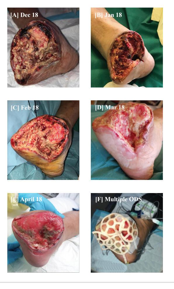
Figure 3. Case Study 1